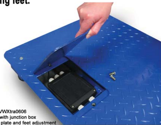
Model VWXtra0606 shown with junction box access plate and feet adjustment

Pit Frames and Ramps for all models available on request.